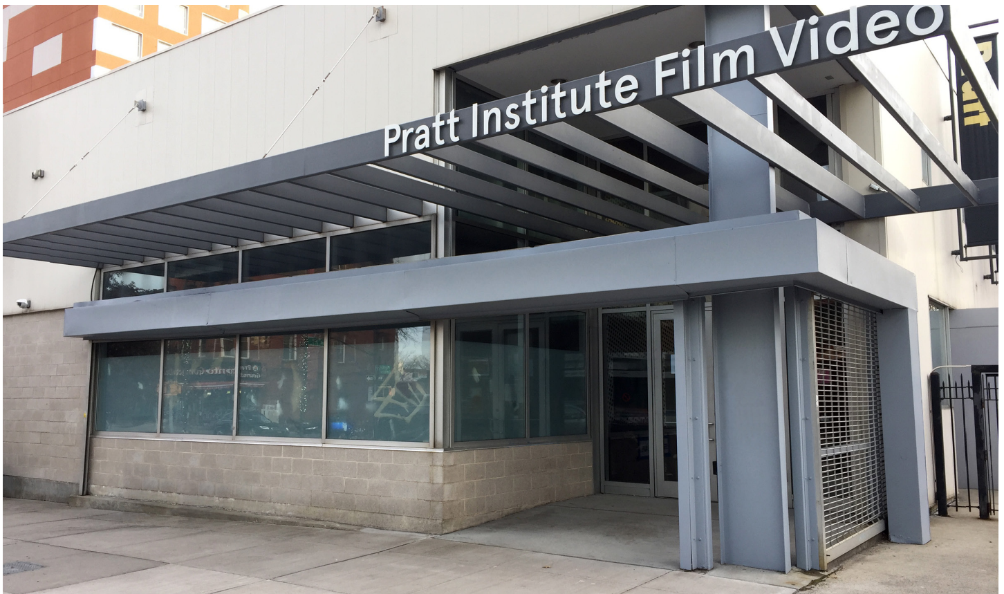
Site 4 Windows 1 - 4 (street-facing)

If you have questions, please contact: myrtleask@pratt.edu