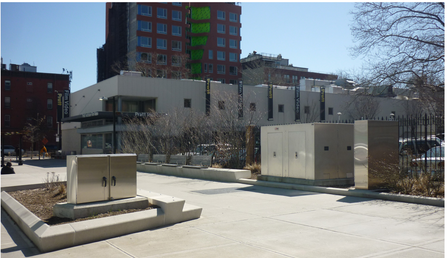
Site 2 Outside the Box