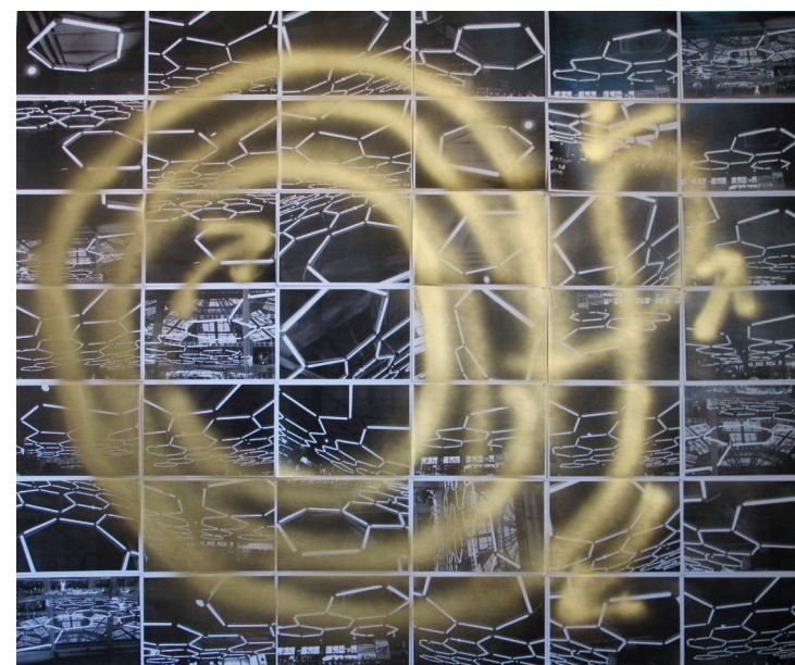
Carlos Schwartz, The Dance 2 , 2016, acrylic and digital print on paper, various dimensions. Courtesy of the artist