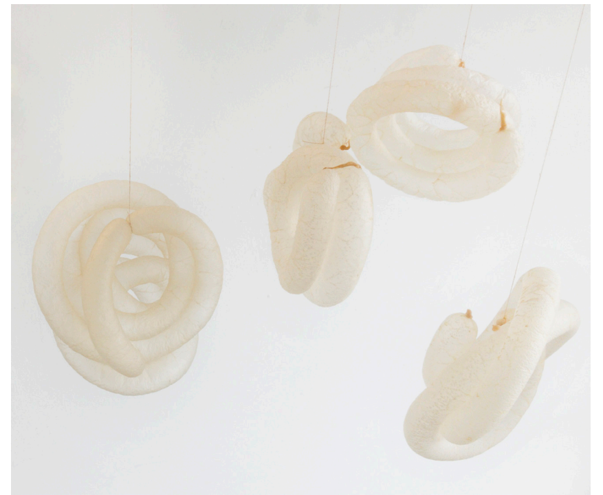
Luisa Valderrama, Menudo , 2019, dried pig intestines, thread, dimensions variable