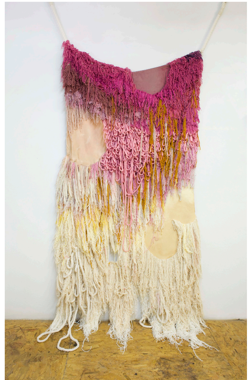
Evan Paul English, Hung or Hanged , 2017, cotton, wool, and acrylic fibers with acrylic paint, 96 x 60 inches with variable depth