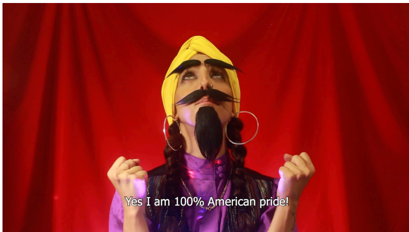
Lara Nasser, EDBTZ, or Uncausing the Cause , 2018, interactive video installation (single channel video, palm trees, neon, pedestals, WHO / WHAT buttons), dimensions variable. In collaboration with Ramsey Nasser