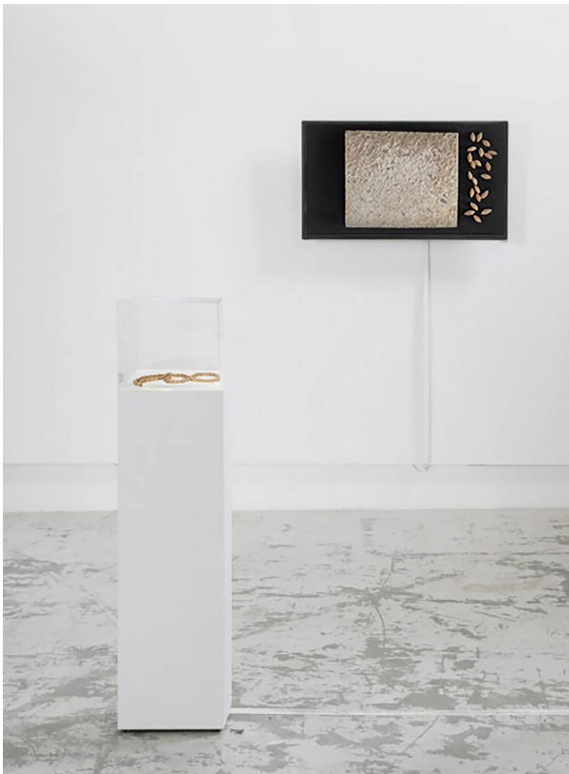
Lana Abu-Shamat, 99 , 2019, video installation, olive pits, off-white silk thread, acrylic cube, 02:36 minutes