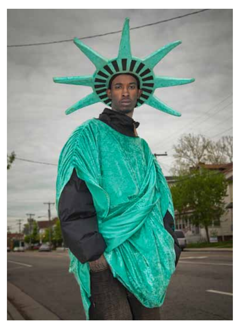
Greta Pratt, "Rodney Parker" from the series Liberty Wavers , 2010–2012, Photograph, 20 x 28 inches.

Other artists draw on the language of popular culture. Donna Catanzaro borrows the over-the-top graphic language of retro horror movie posters to suggest how mindless greed and