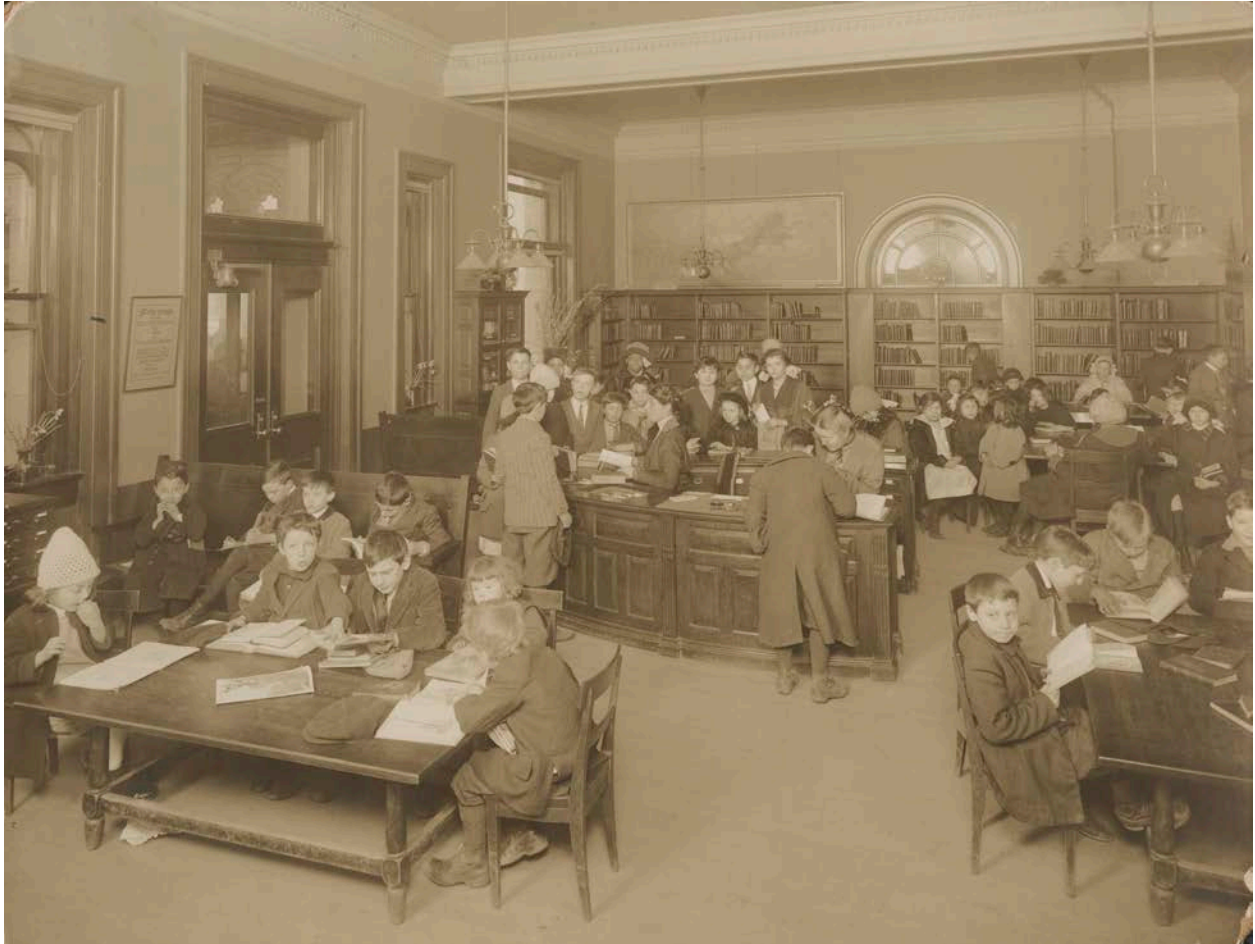
"Children's Room Looking West" 1914 March.