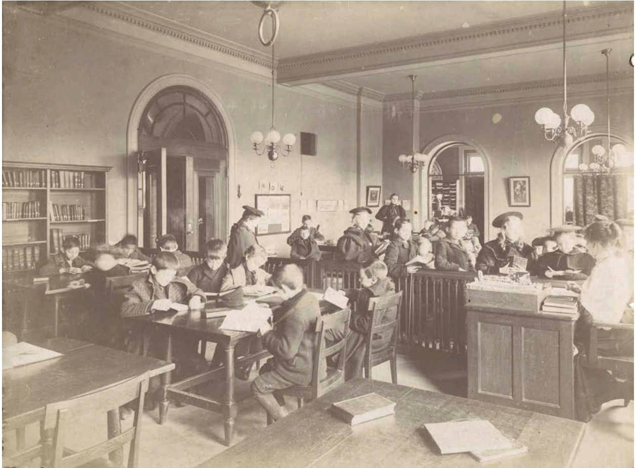
“Children’s Room Looking East, Pratt Institute Free Library” 1897

The Children’s Room at the Pratt Institute Free Library was introduced to the Brooklyn area at the May 1896 grand opening on Ryerson Street. With its opening, the room already achieved the distinction of being the first children’s room in America to be included in an architectural plan for a library and realized through construction (Stone, 1977, p.182-183). While initially driven by pragmatic noise concerns, some of Plummer’s letters and speeches around the opening of the library indicate that she had more ambitious designs on the Children’s room. Speaking at a conference before the opening of the library, Plummer described the ideal children’s library room as being complete with “suitable books, plenty of room, plenty of assistance, and thoughtful administration” (Stone, 1977, p.184). To helm the room, Plummer hired recent Pratt Institute Library School graduate Anne Carroll Moore.