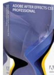
Adobe After Effects Pro