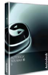
Discreet 3DS Max*