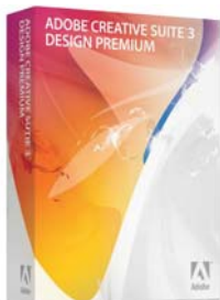
Adobe Creative Suite Design Premium