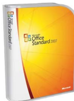
Microsoft Office Standard