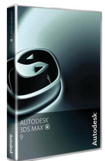
Discreet 3DS Max