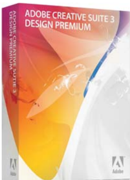
Adobe Creative Suite Design Premium