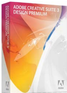
Adobe Creative Suite Design Premium