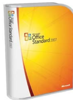
Microsoft Office Standard